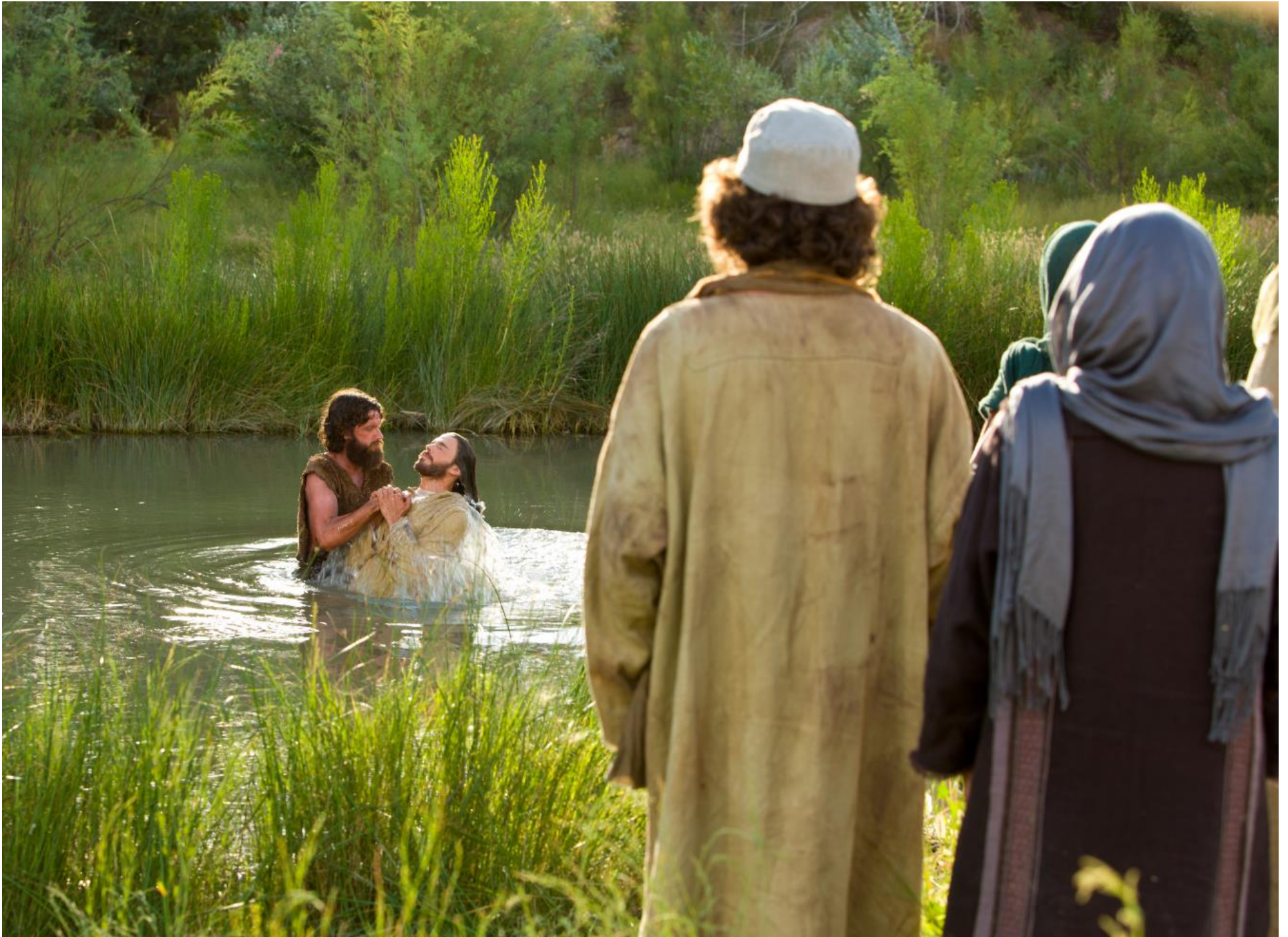
BAPTISM – CONCENTRATION // Created by PrimarySinging.com – For personal and church use. Do not distribute.