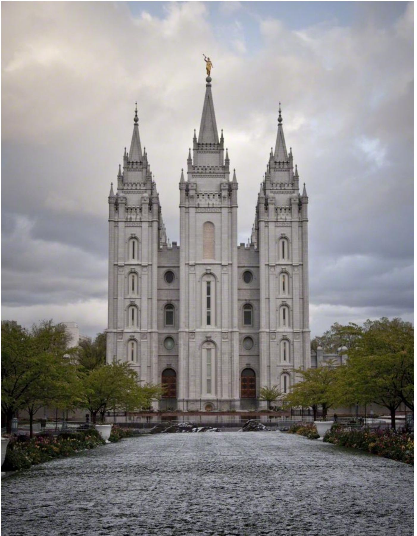
SALT LAKE CITY, UTAH