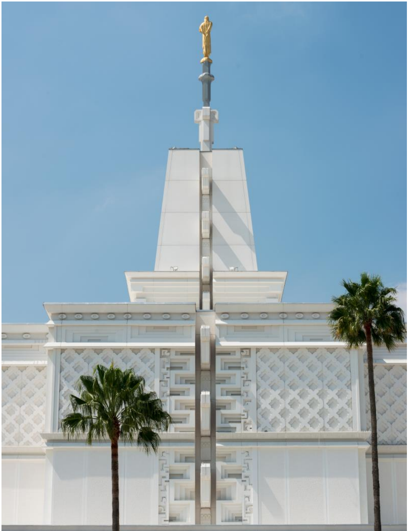
MEXICO CITY, MEXICO