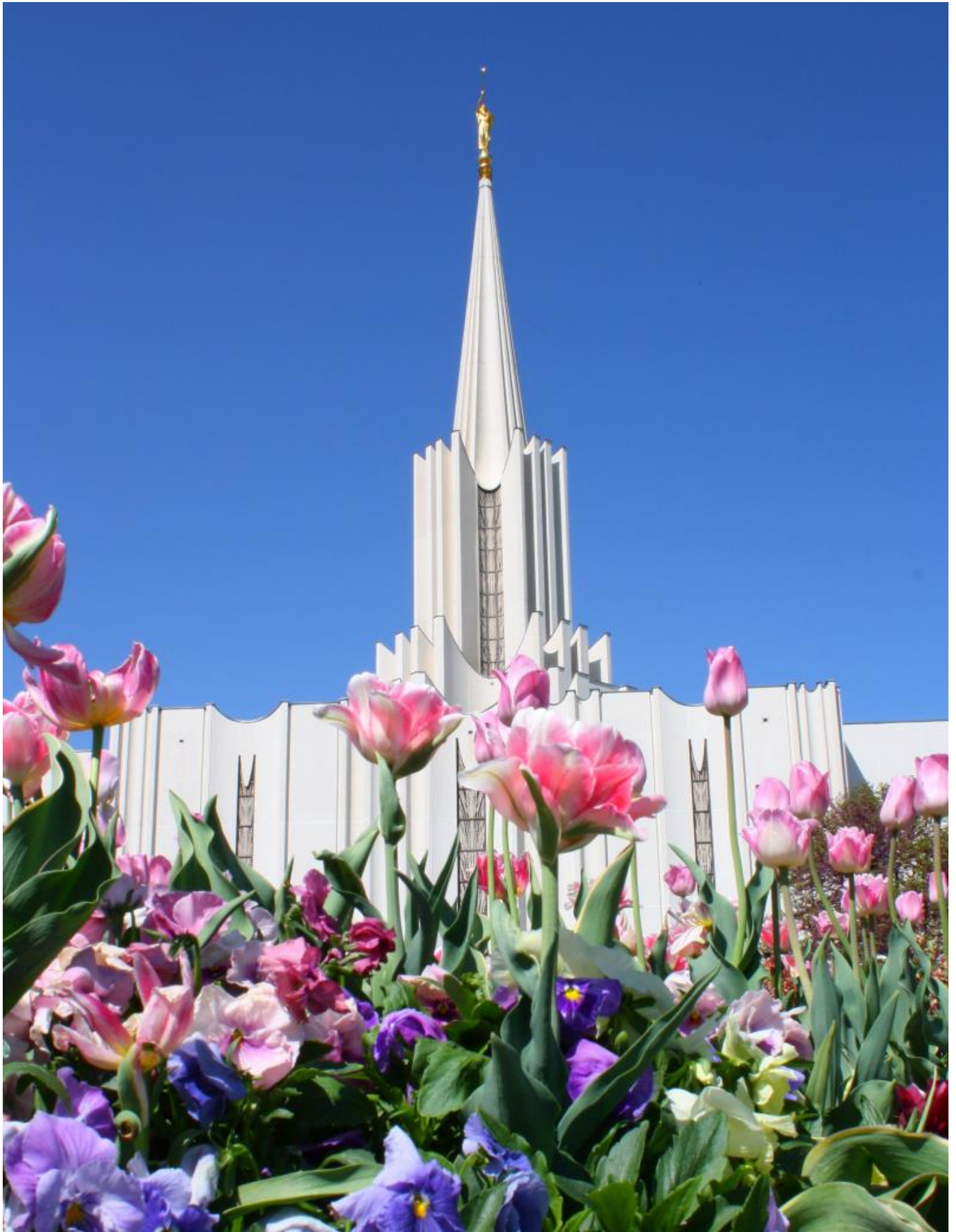
JORDAN RIVER, UTAH