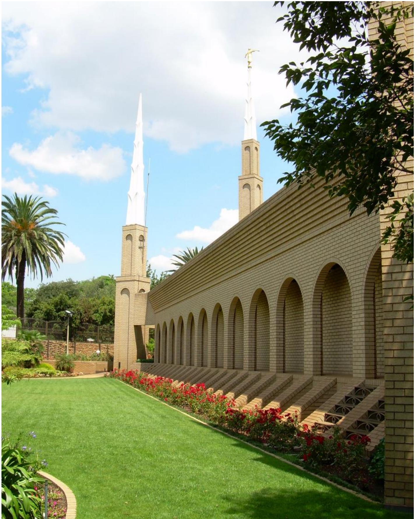
JOHANNESBURG, SOUTH AFRICA