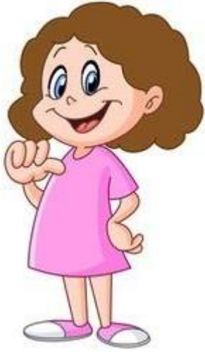
POINT TO SELF